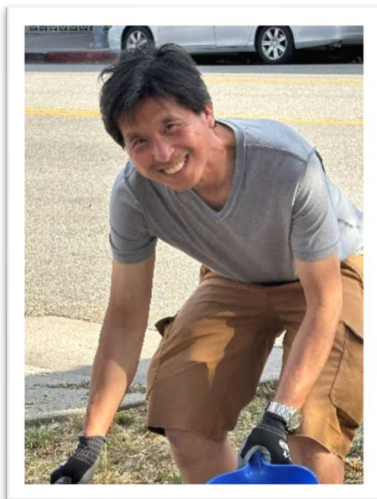
Volunteers at CHSSC