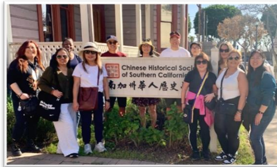
Kinecta Credit Union at CHSSC