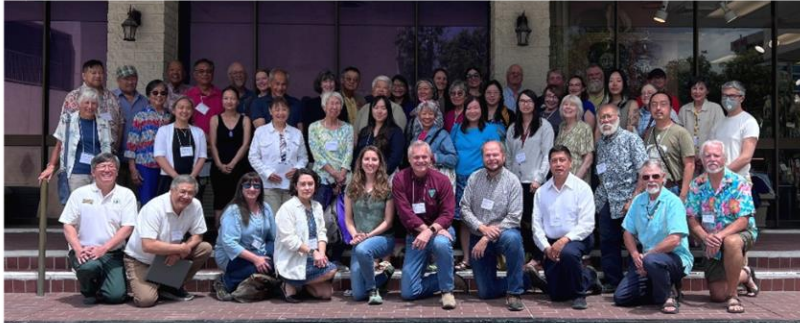
Attendees at Rural Chinatowns and Hidden Sites Conference, June 18-21, 2024 at Salt Lake City UT