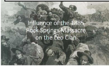
Influence of the 1885 Rock Springs Massacre on the Leo Clan