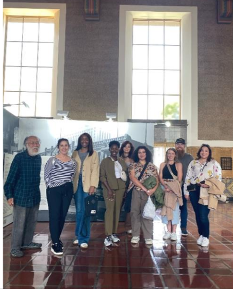
Walking tour at Union Station with Crew LA -Women in Real Estate