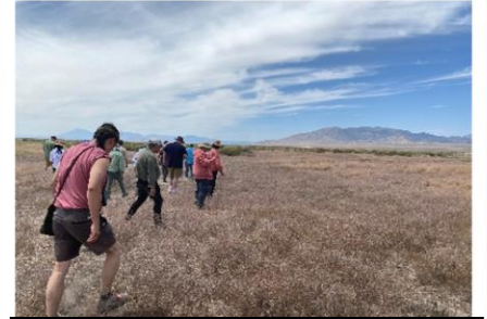
Desert landscape crossed by Chinese RR workers in 1869