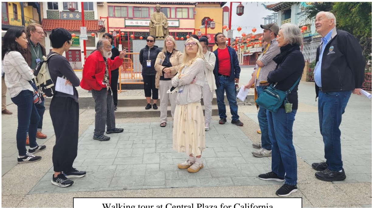
Walking tour at Central Plaza for California Preservation Foundation Conference