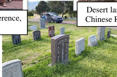
Chinese burial ground in Salt Lake City Cemetery