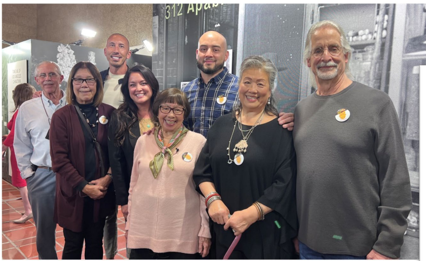
Descendant family in front of Sang Yuen & Co exhibit.