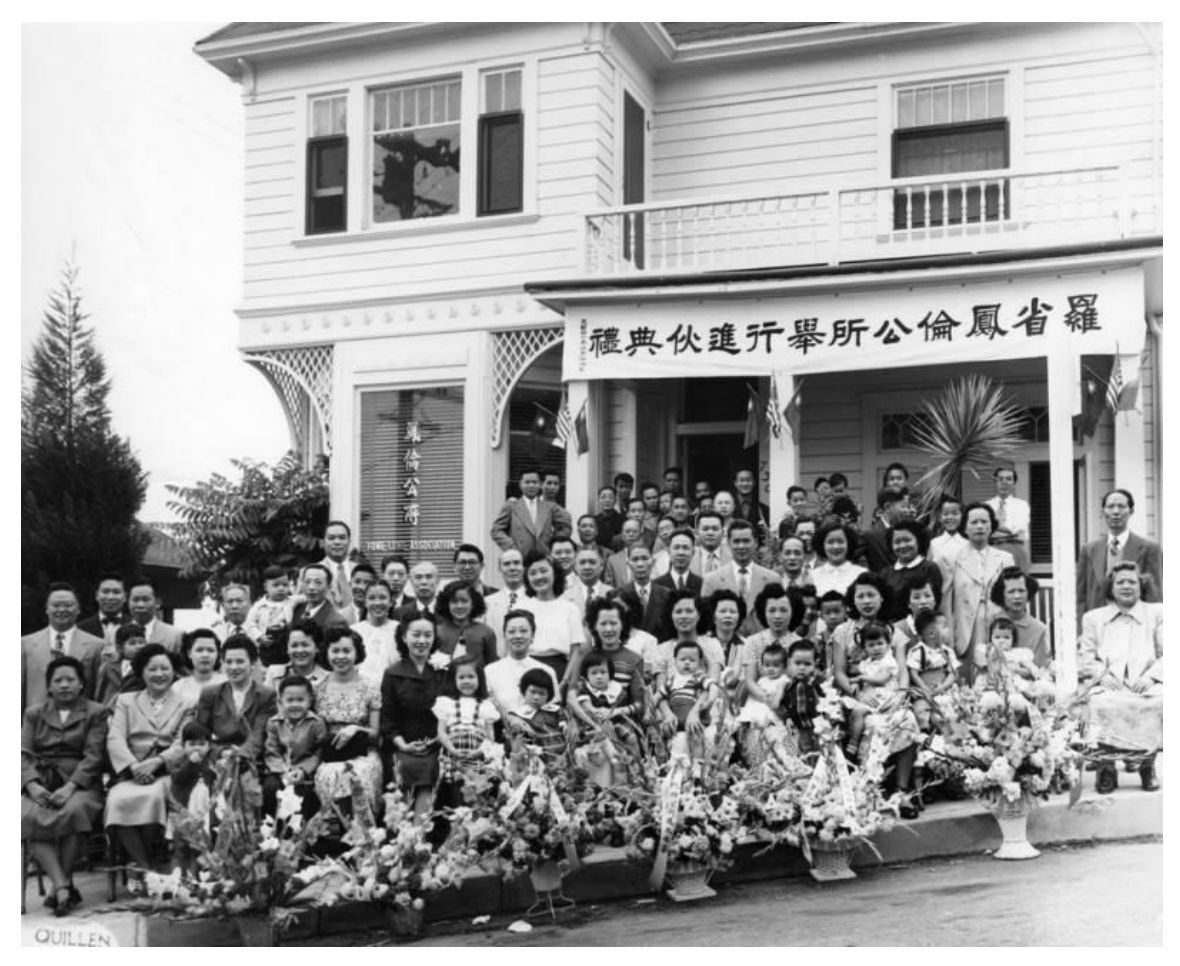
Fong Lum Historic Image

Visit our on-line exhibit at <u>https://chssc.org/chinatown-associations-anchors-of-the-community/</u> and hear the voices of the leaders and members of these associations and see current and historical photographs. This exhibit was made possible by a generous donation from the David and Pearl Louie Family Foundation.