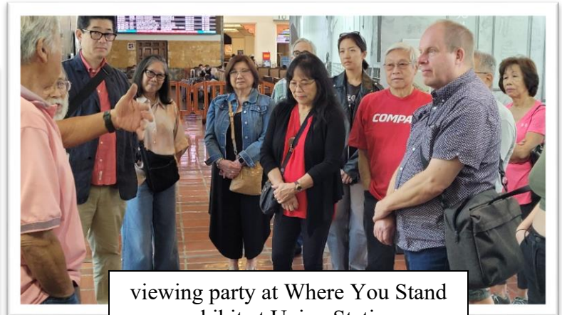
viewing party at Where You Stand exhibit at Union Station