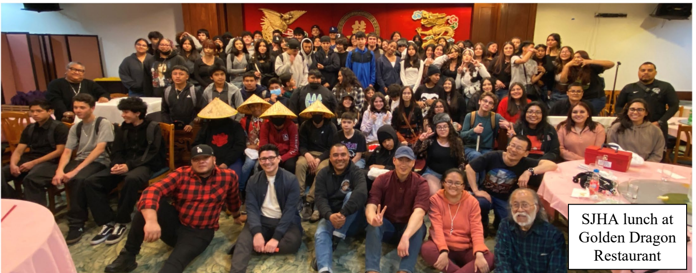
SJHA lunch at Golden Dragon Restaurant