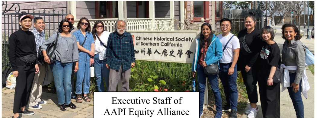
Executive Staff of AAPI Equity Alliance