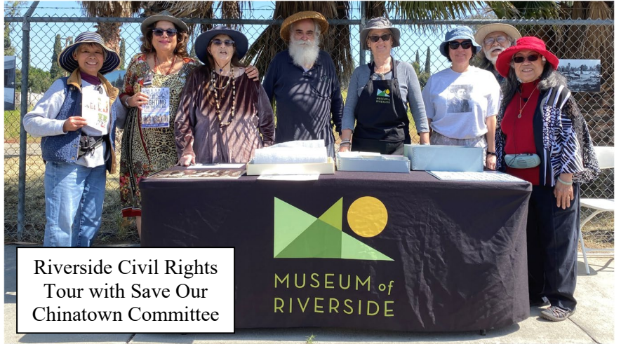
Riverside Civil Rights Tour with Save Our Chinatown Committee