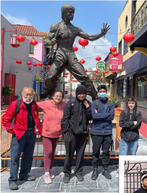
Social Justice Humanitas Academy (SJHA) LAUSD Charter School in San Fernando Valley walking tour