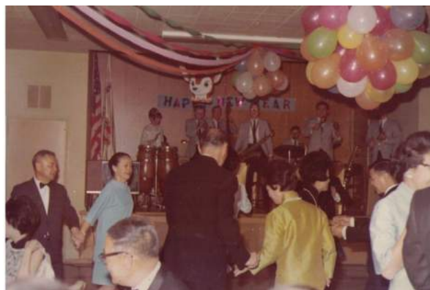
The photo above is from the CACA Lodge 1967 New Years Party complete with a live band and dancing.