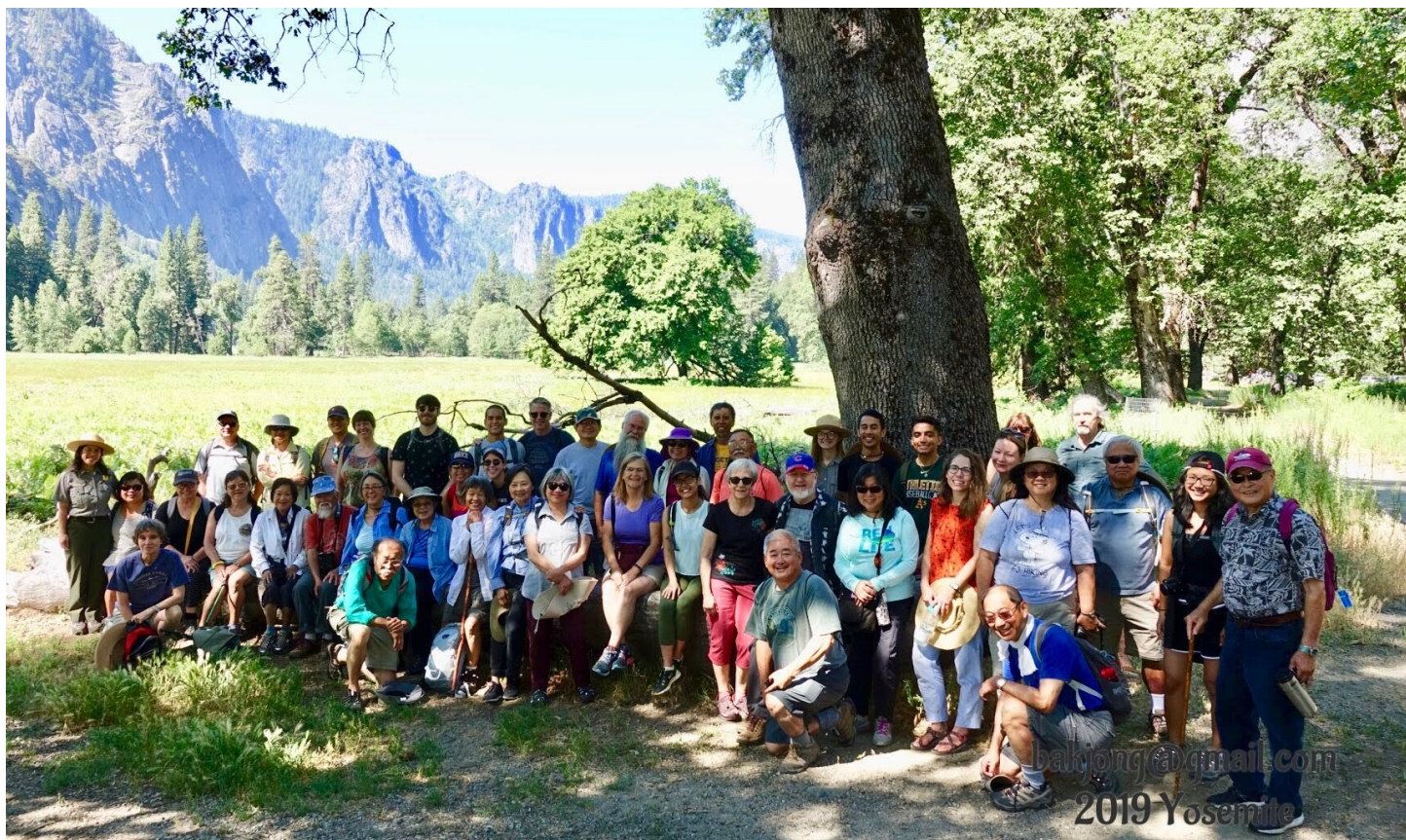
Above: the entire 2019 CHSSC Yosemite Trip group.