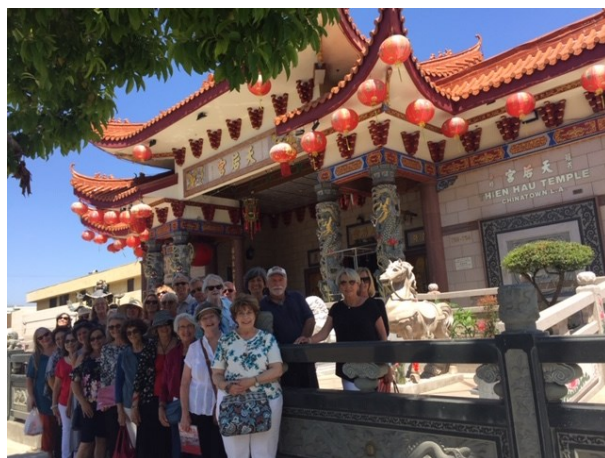
The Ventura seniors at the Thien Hau Temple in Chinatown.