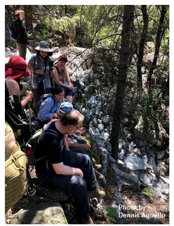
Sitting on Rock Wall Built by Chinese Workers on an early Yosemite Valley Road.