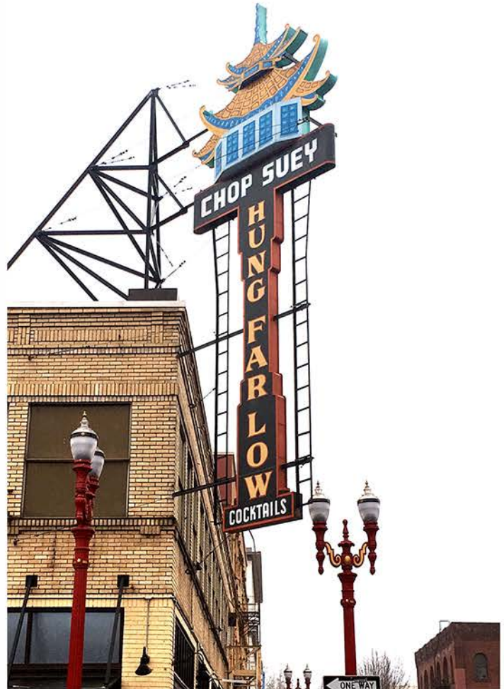
Hung Far Lowe sign in Portland, Oregon.