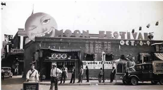
1938 Moon Festival