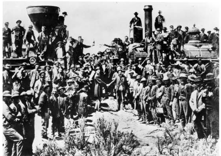
The original photo commemorating the completion of the first transcontinental railroad in 1869 did not include Chinese laborers.

"History — at least photographically — says that the Chinese were not present," says photographer Corky Lee.