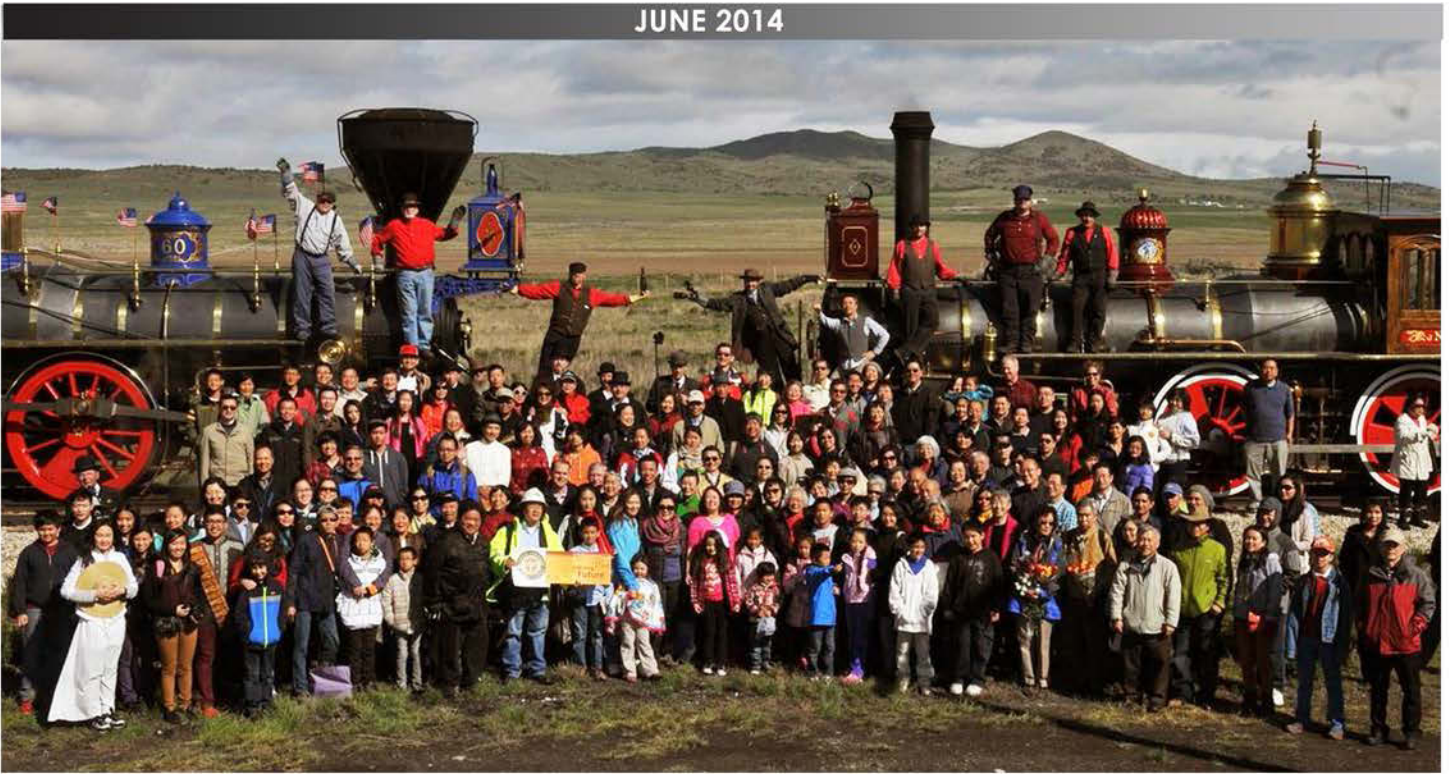
On May 10, 2014 a group of Asian Americans, including descendants of Chinese railroad workers, recreated an iconic photo on the 145th anniversary of the first transcontinental railroad's completion at Promontory Summit, Utah.

Excerpts from NPR's Code Switch by Hansi Lo Wang