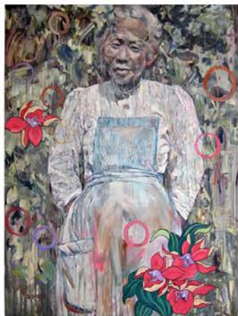
Hung Liu, In the Garden 1 , 2005, Oil on canvas, Courtesy of the artist and Walter Maciel Gallery, Los Angeles © Hung Liu

46 N Los Robles Ave., Pasadena, CA 91101 626-449-2742 www.pacificasiamuseum.org