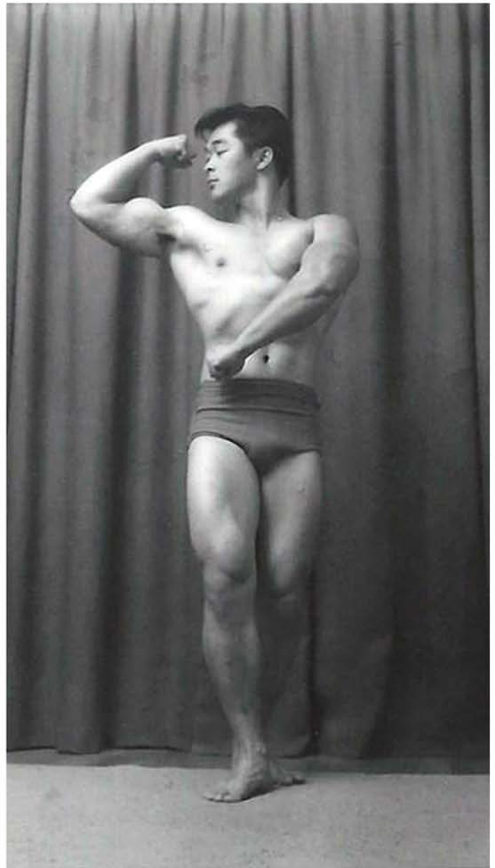
Mr. Chinatown U.S.A. 1958