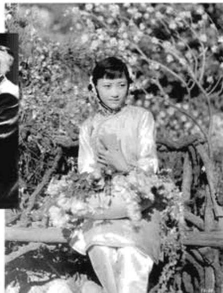
Anna May Wong - The Toll of the Sea