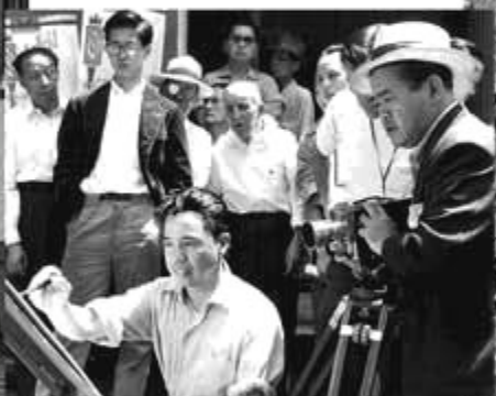
James Wong Howe and Dong Kingman in 1953