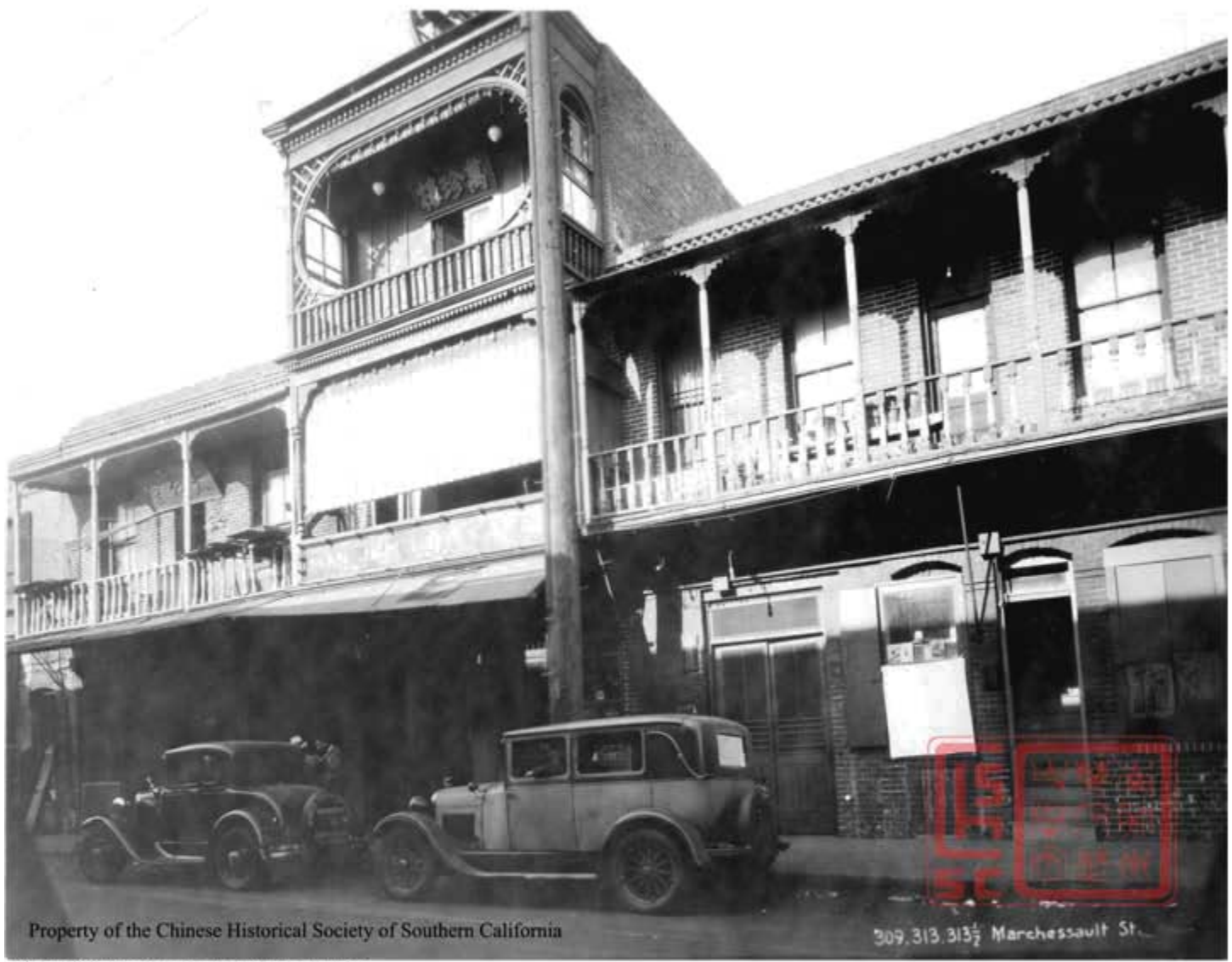
309, 313, 3131/2 Marchessault Street / Man Jen Low Cafe

CHSSC has acquired a rare collection of 124 photos depicting Los Angeles' Old Chinatown and its surrounding area. These black and white images (circa 1928-1932) were taken prior to the demolition of Chinatown and the construction of Union Station. Below are examples of those precious photos. A comprehensive exhibit will be on display in the near future.