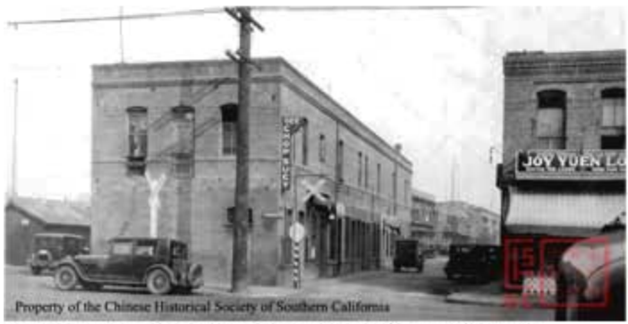
Corner of Apalabasa Street & Alameda Street / Gee Choy Suey - Joy Yuen Low