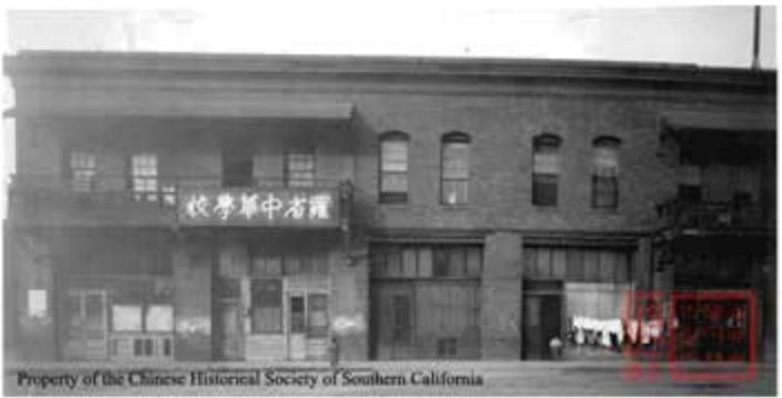
401 to 415 Apalabasa Street / Chinese School