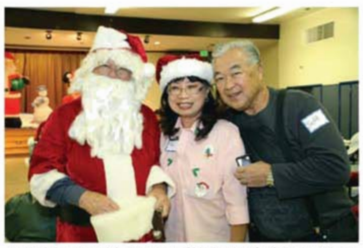
A special guest took time out of his busy schedule to make a surprise appearance.