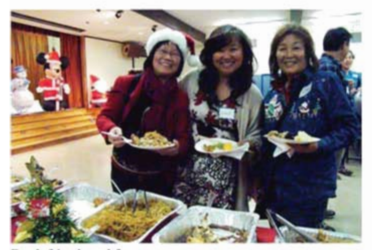
Food, friends and fun.