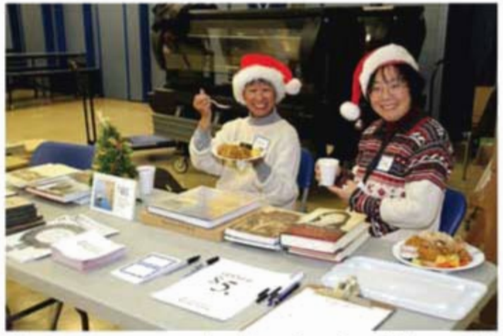
Time to renew your membership and purchase Christmas gifts.