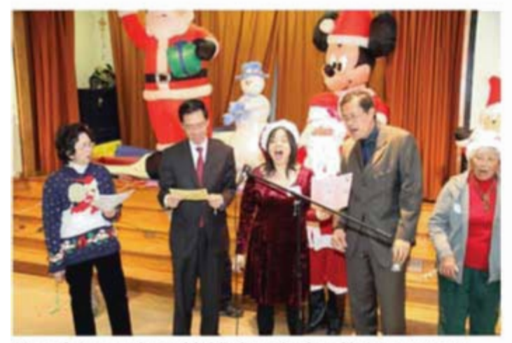
One of the evening's highlights, singing Christmas carols.