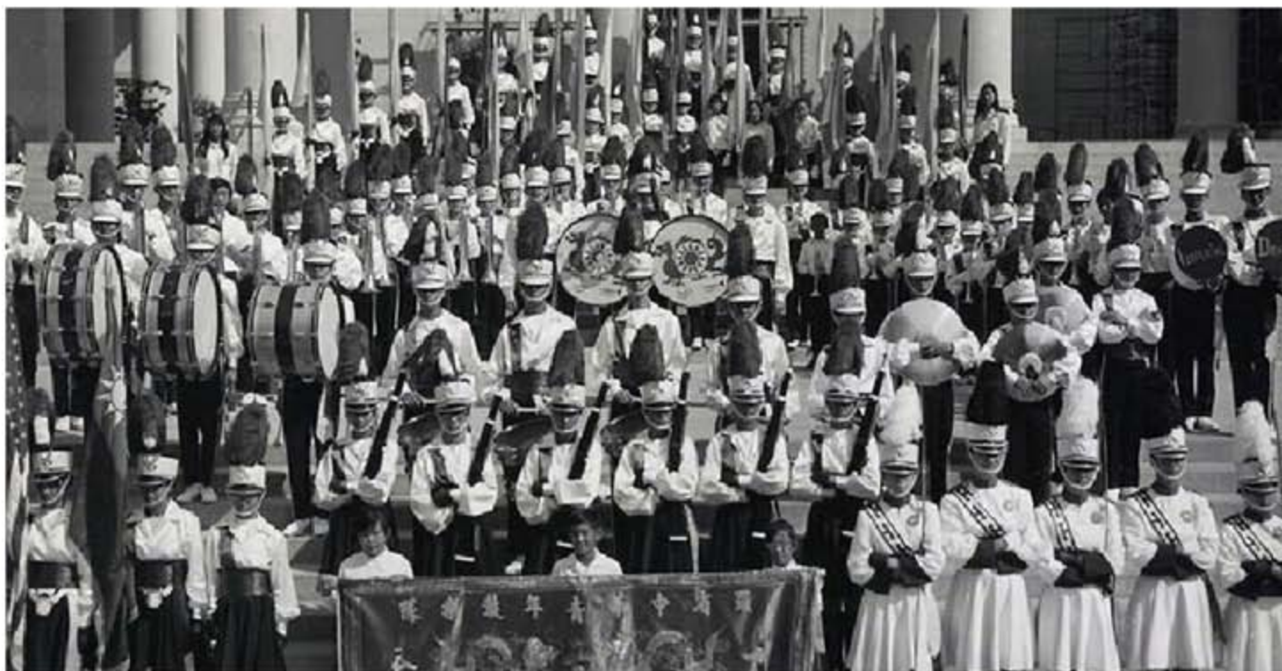
The Los Angeles Chinese Drum And Bugle Corps., January 1970. At the steps of Los Angeles City Hall just prior to the Chinese New Year Parade.