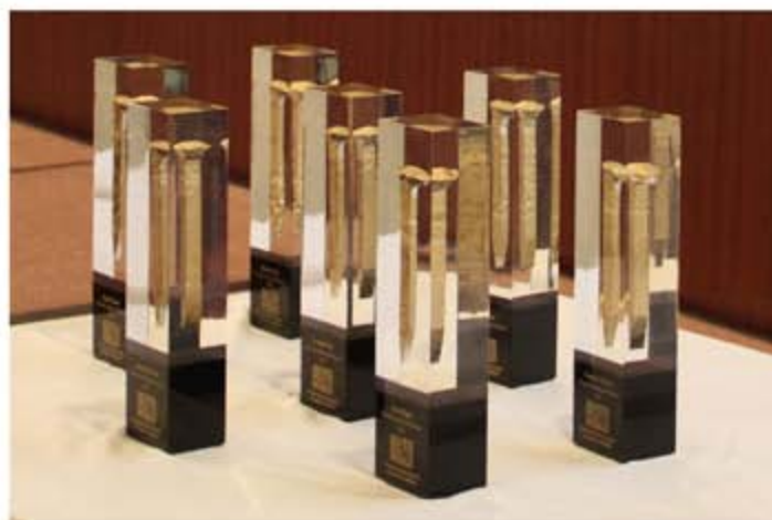
The "Golden Spike Awards".