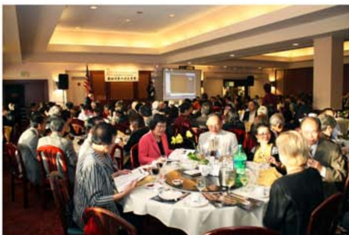
Guests settling in for an evening of celebration, great food and fun.