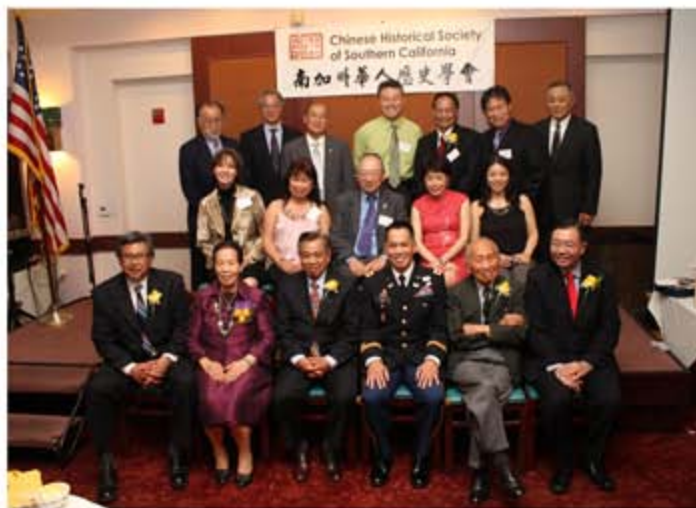
CHSSC Board of Directors and 2011 Honorees.