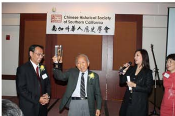
Tyrus Wong accepting his award.