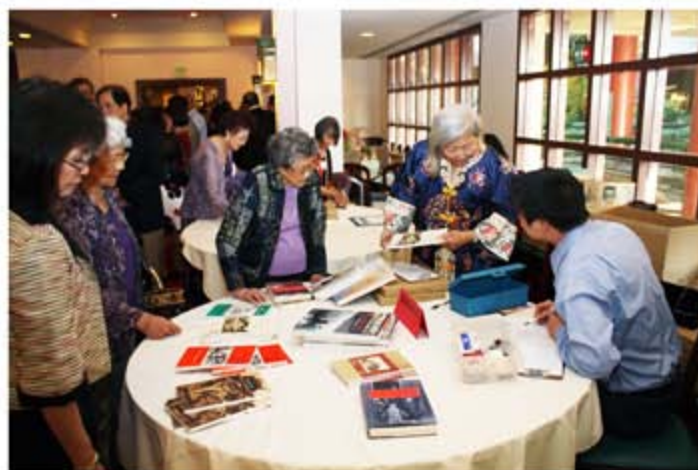
CHSSC publications including recently published Portraits of Pride II .