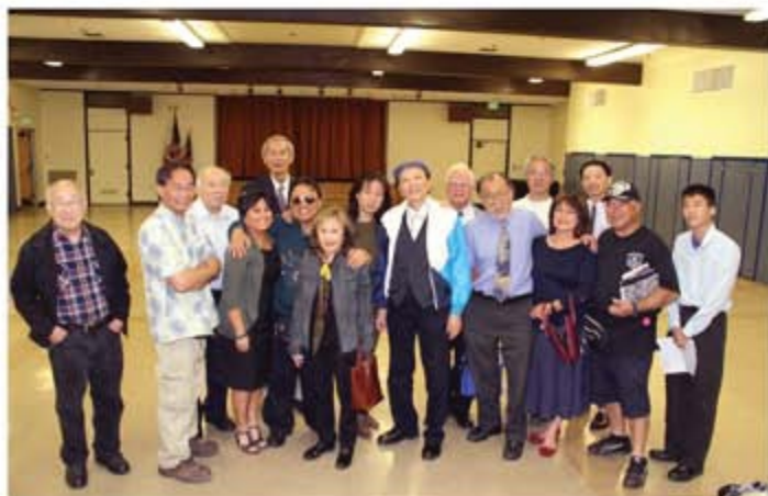
Some of the 80+ attendees of the CHSSC meeting