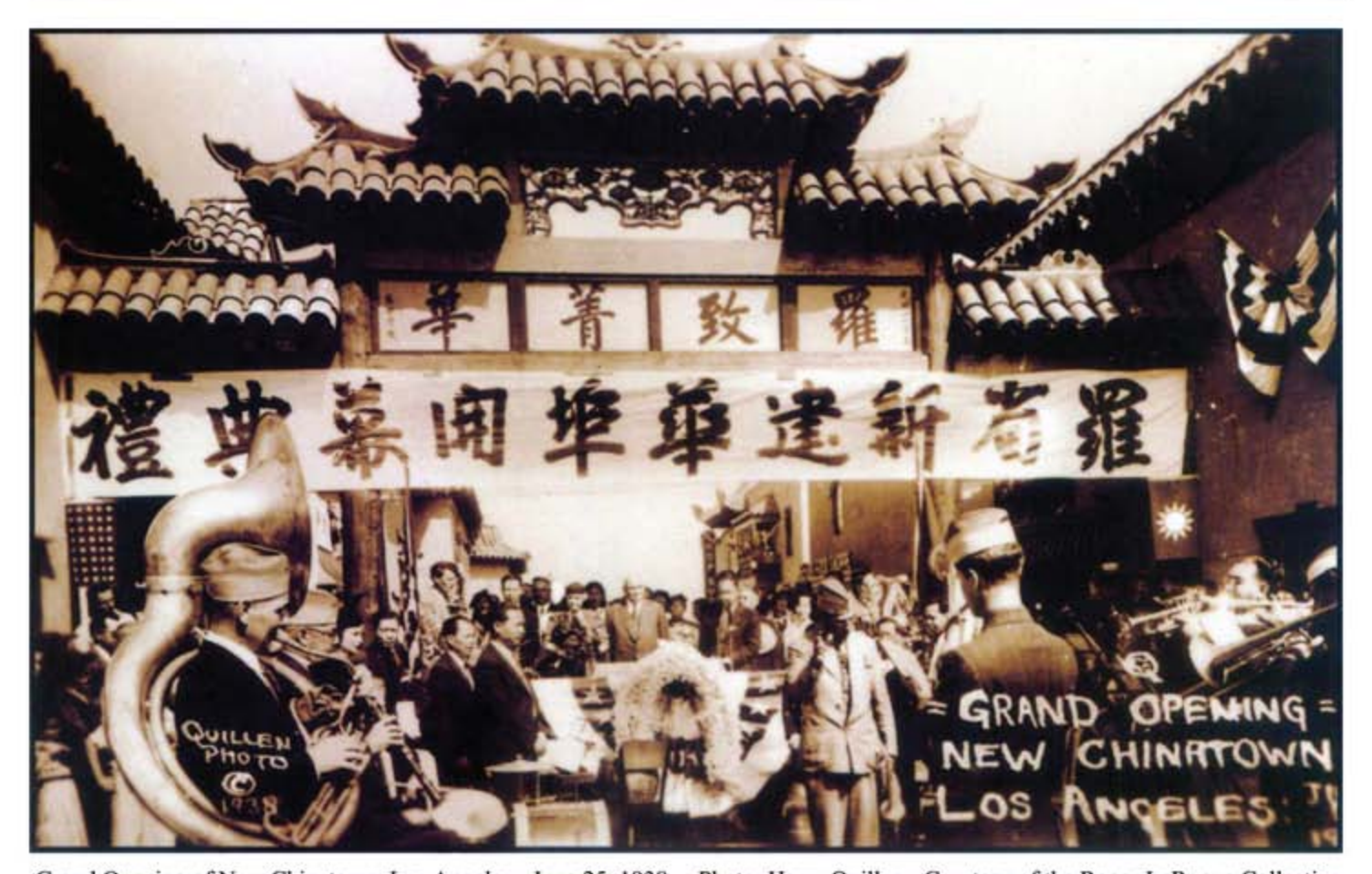
Grand Opening of New Chinatown, Los Angeles - June 25, 1938