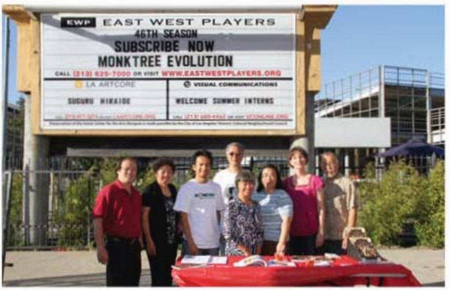
CHSSC members promoting Portraits of Pride II at the event.