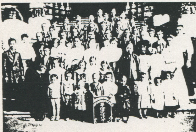
Members of the Chinese Congregational Church of Los Angeles, 1907.