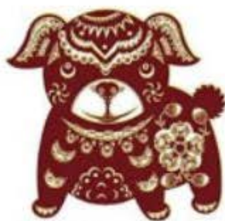
2018 Year of Dog